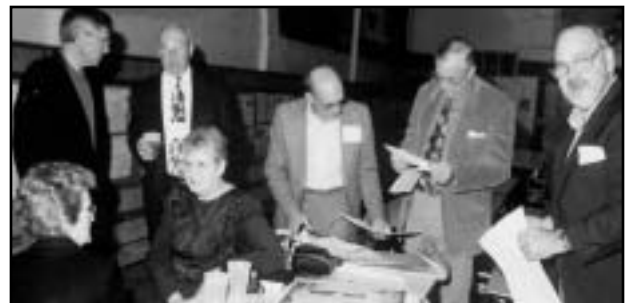
Those were the days

For those wise enough to pay attention, the rewards continue to be reaped.