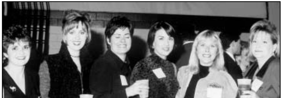
School was such fun

Your Ten Year Anniversary of Graduation, next November 6. Come Yourself. Tell your fellow grads! If you know the whereabouts of any of the '94 grads call 256-2337 or write us.